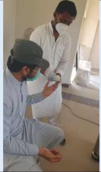
COVID-19 Tests of SRSO Ghotki Staff at Engro Hospital DHarki