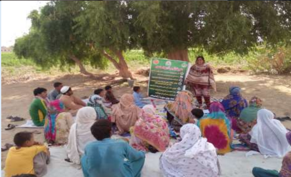
COVID-19 Community Awareness Sessions at Khairpur District