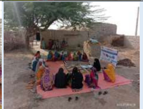
Community based Awareness sessions at District Shikarpur