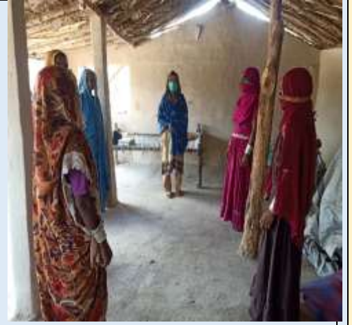
COVID-19 Awareness sessions were conducted under NCOC agreement at District Mirpurkhas